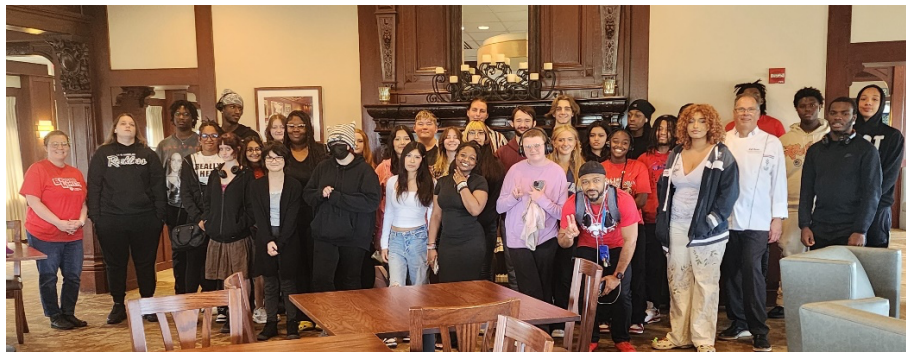
Rochester High School

The Ivy Tech Hospitality Administration program offers dual credit agreements through 27 high schools and career centers in central Indiana, plus additional rural areas. There are 150 dual credit Culinary/Hospitality classes being taught by 44 credited and approved high school teachers. Ivy Tech's dual credit programming reaches over 3,000 high school students; bringing college coursework to their classrooms while strengthening the pipeline for future students in our Ivy Tech program.