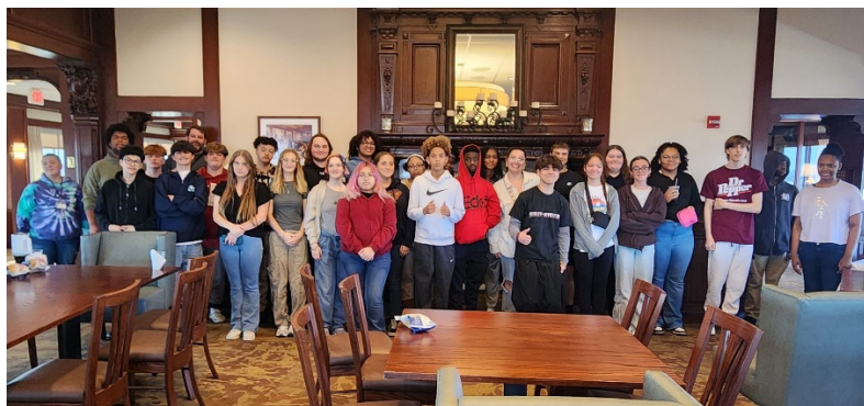
Kokomo Area Career Center